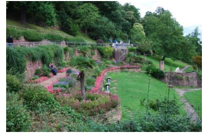
The Philosophers' Garden, a climate island where many exotic plants flourish.

In view of everything the city has to offer, guests are also spoiled for choice when it comes to planning their evenings. Heidelberg boasts a historic theater , completely renovated in 2012, offering three branches of the art. This is augmented by several private smaller stages. The cultural repertoire in this polyglot small metropolis is just as lively and multi-faceted as the visitors who make their way here from all over the world. This also applies to the gastronomy and hostelry - from the many student pubs and bars to the grand gourmet restaurants, from the back-packer district to the 5-star hotel.