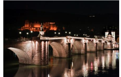
The illuminated Old Bridge and the famous Castle by night.

Another famous spot is the Philosophers’ Walk - where scholars once strolled in their stiff frock-coats to relax their thoughts with a walk. Exotic plants flourish here on this tiny climate island, which is one of the warmest places in Germany: Japanese plum and American cypress, Spanish broom and Portuguese cherry, lemons and pomegranates, bamboo, palms, pines. Everything here comes into blossom weeks earlier