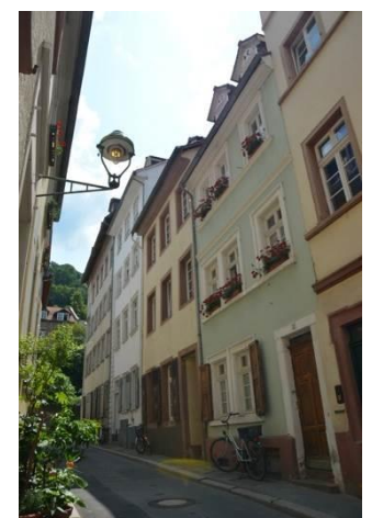
Immerse yourself in the history of the city during a tour through the winding alleyways of the Old Town.